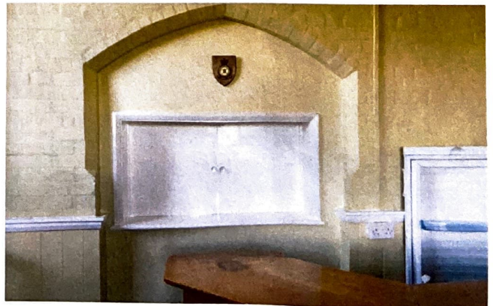
The old kitchen and bar area in need of improvement