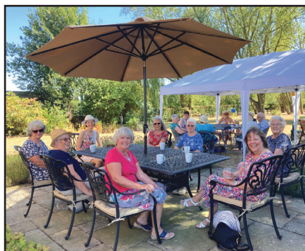
In August the ladies of the WI enjoyed tea at Brook Hall Cottage, Daisy Green