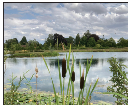
The beautiful gardens at Holm House, Drinkstone, which the WI visited in July