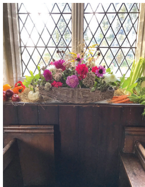
The church windows were beautifully decorated for Harvest Festival