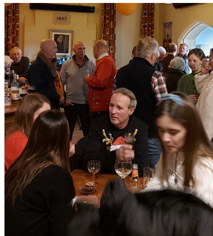
The Christmas pub night proved to be a very popular event