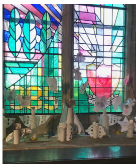
Hark The Herald Angels Sing was depicted by hand made angels

These were then sung during the carol service. The decorations were very creative, all quite different and much admired by all those who attended the service.