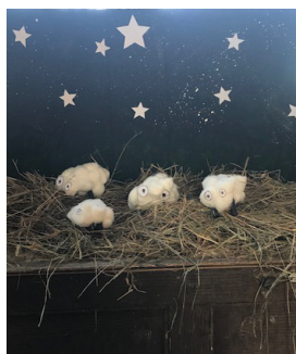
While Shepherds Watch Their Flocks by Night under a starry sky