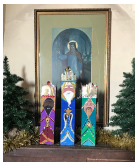
We Three Kings of Orient Are made a very colourful sight