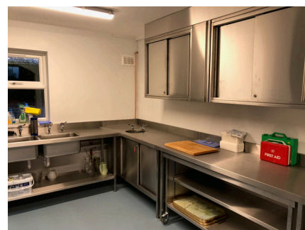
The new kitchen will make catering for any gathering much easier