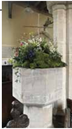
The font, beautifully decorated for Easter

The Benefice village and church news magazine is available to read online www.vcnews.org.uk