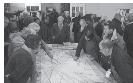
Some of the many visitors studying the 1911 virtual walk, taken at the November 2018 WW1 exhibition